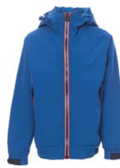
Blu royal / Royal blue