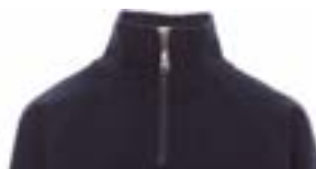
Blu navy / Navy blue