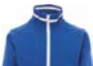
Blu royal / Bianco Royal blue / White