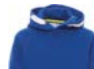
Blu royal Royal blue