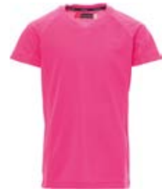
Fuxia fluo / Fluorescent fuchsia