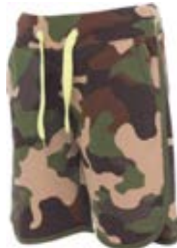
Mimetico / Giallo fluo Camouflage / Fluorescent yellow