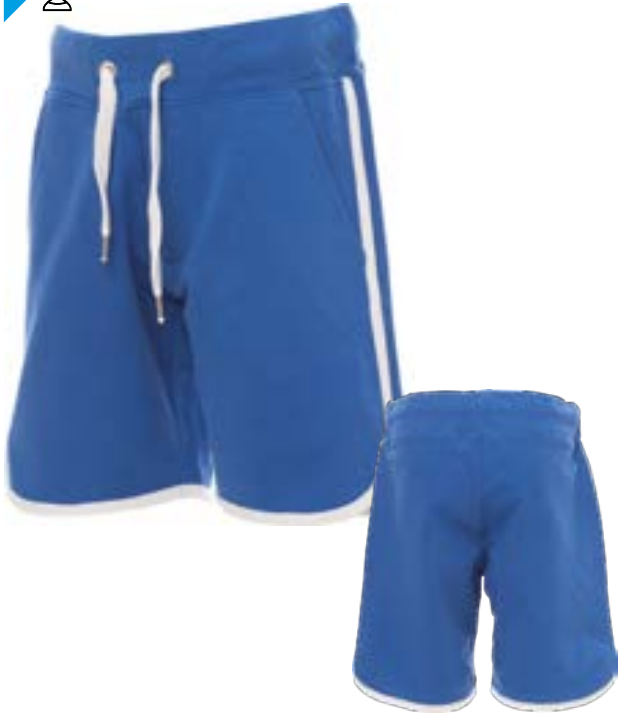
Retro / Back