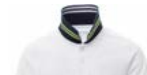
Bianco / Blu navy - Bianco / Giallo fluo White / Navy blue - White / Fluorescent yellow