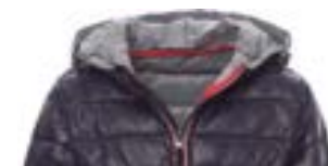
Blu navy / Grigio Navy blue / Grey