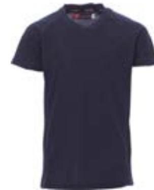
Blu navy / Navy blue