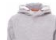
Grigio melange Melange grey