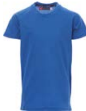
Blu royal / Royal blue