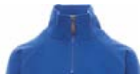
Blu royal / Royal blue