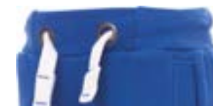
Blu royal Royal blue