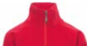
Rosso / Red