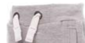
Grigio melange Melange grey