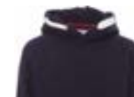
Blu navy Navy blue