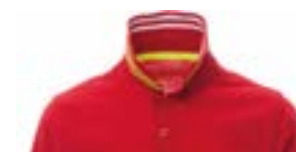
Red passion / Bianco - Giallo fluo Passion red / White - Fluorescent yellow