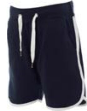
Blu navy / Bianco Navy blue / White