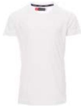
Bianco / White