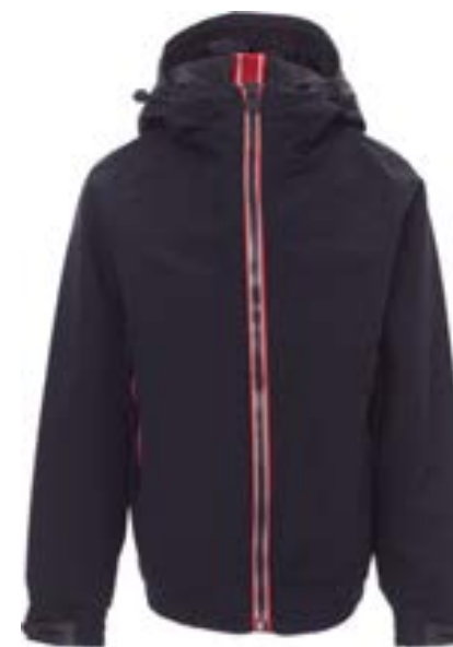
Blu navy / Navy blue