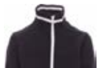
Nero / Bianco Black / White