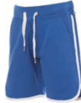
Blu royal / Bianco Royal blue / White