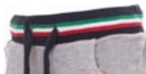
Grigio melange-Italia Melange grey-Italy