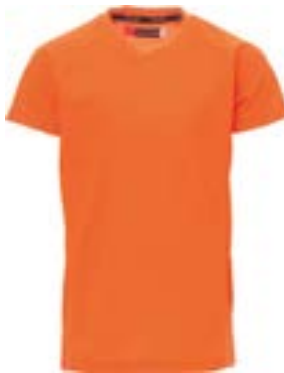
Arancione fluo / Fluorescent orange