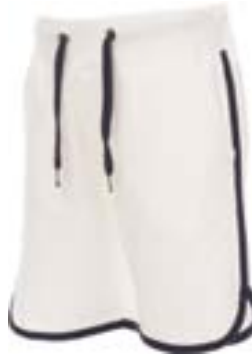
Bianco / Blu navy White / Navy blue