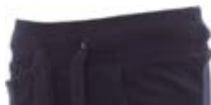
Blu navy Navy blue