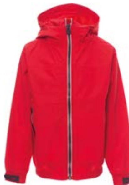
Rosso / Red