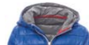
Blu royal / Grigio Royal blue / Grey