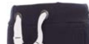
Blu navy Navy blue