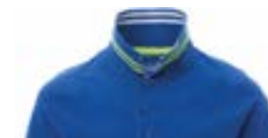
Nautical royal / Bianco - Giallo fluo Nautical royal / White - Fluorescent yellow