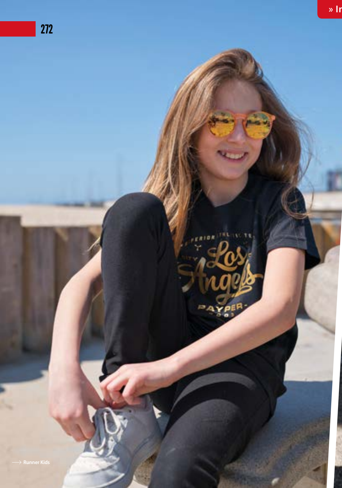
→ Runner Kids