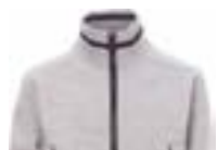
Grigio melange / Blu navy Melange grey / Navy blue