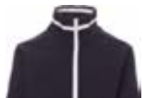
Blu navy / Bianco Navy blue / White