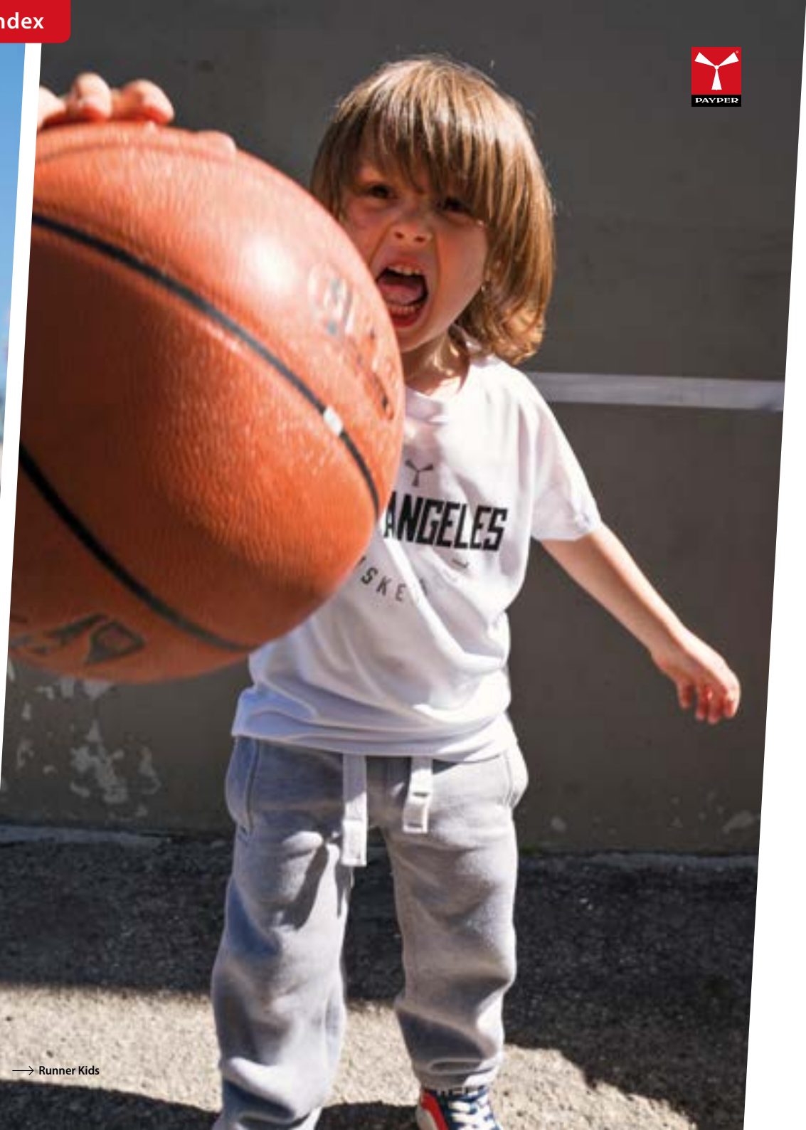
→ Runner Kids