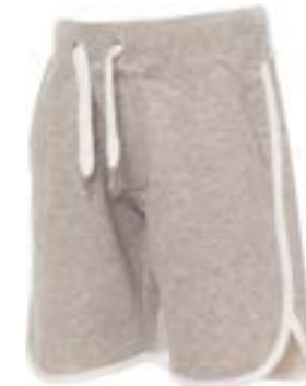
Grigio melange / Bianco Melange grey / White