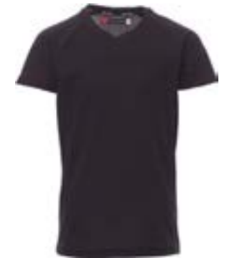
Nero / Black