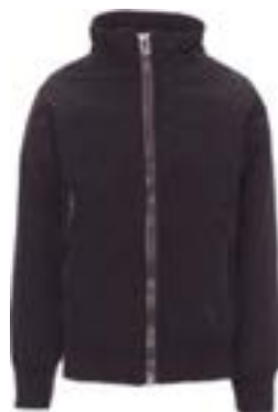
Nero / Black