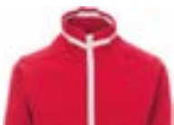
Rosso / Bianco Red / White