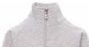
Grigio melange / Melange grey