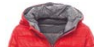
Rosso / Grigio Red / Grey