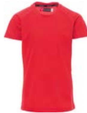
Rosso / Red