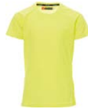
Giallo fluo / Fluorescent yellow