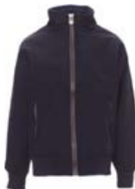
Blu navy / Navy blue