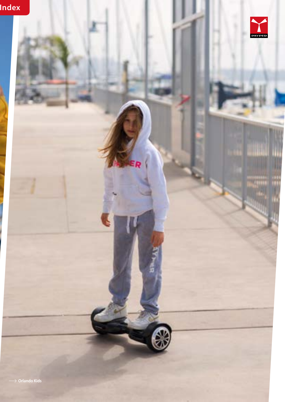
→ Orlando Kids